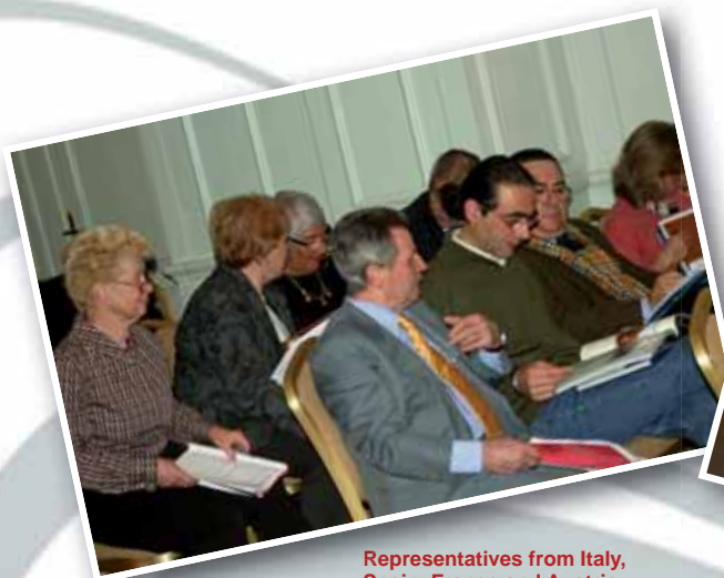
Representatives from Italy, Spain, France and Austria

The assembly honoured the dead with a minute of silence.