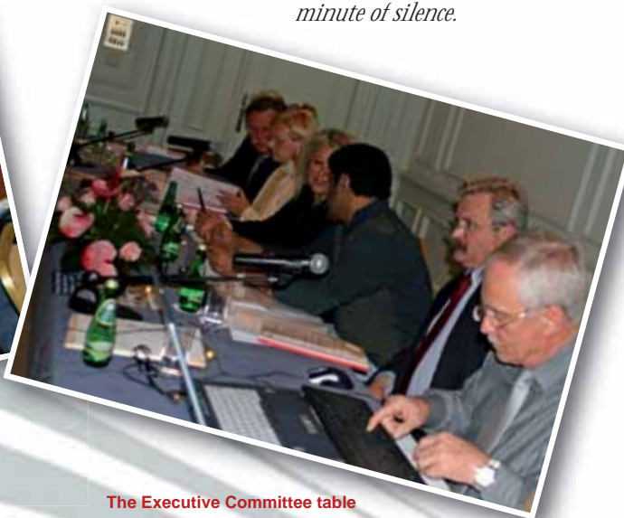
The Executive Committee table